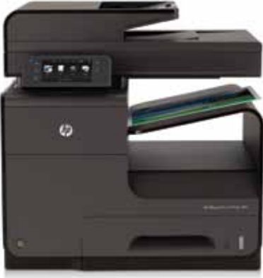
HP Officejet Pro X476dn

Print professional-quality color—up to twice the speed 1 and up to half the cost per page of color lasers 2 —using HP PageWide Technology. Help workgroups thrive with versatile functions and easy manageability.